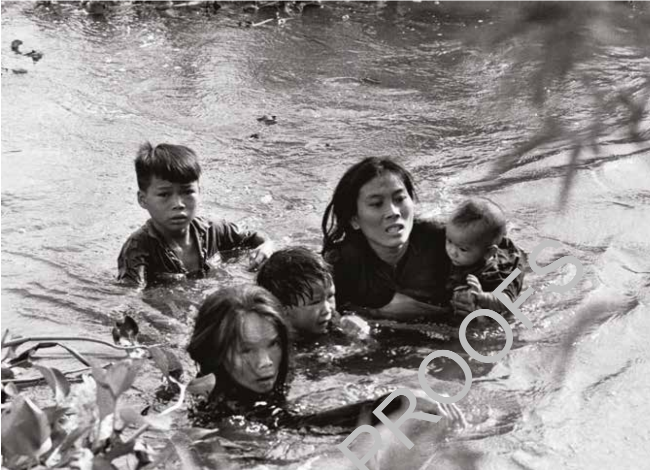
A South Vietnamese mother struggles to escape across a flooded river with her four children.