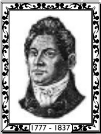
Famous Faces from History