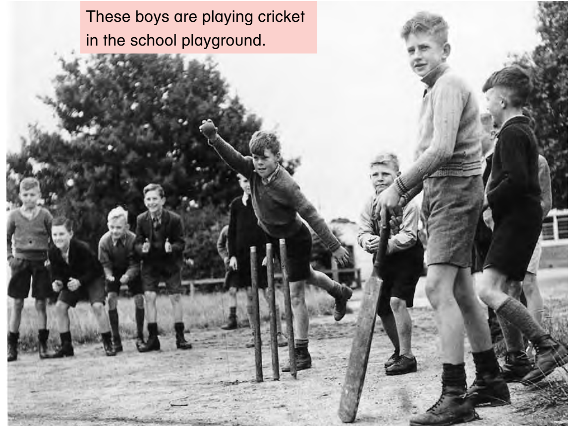
These boys are playing cricket in the school playground.

Cricket and football were played in backyards, playgrounds, parks and side streets all over Australia. Some children belonged to their local club and played against children from other clubs.