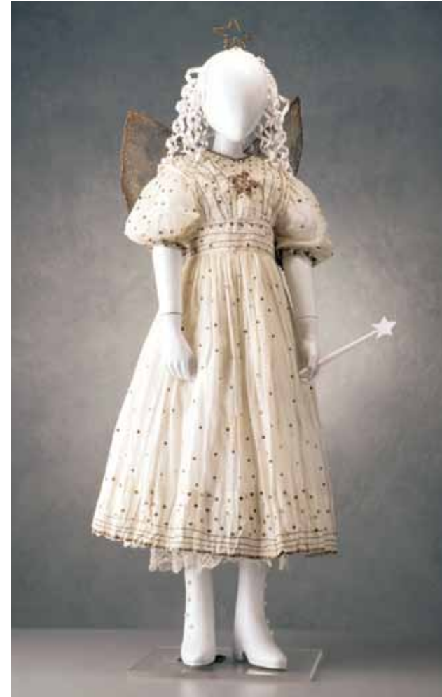
A fairy costume

Playing dress ups was always fun. Some mothers made costumes for their children. Others bought them at the shop. Some children wanted to dress up as characters from films. Others wanted to be nurses, policemen or doctors.