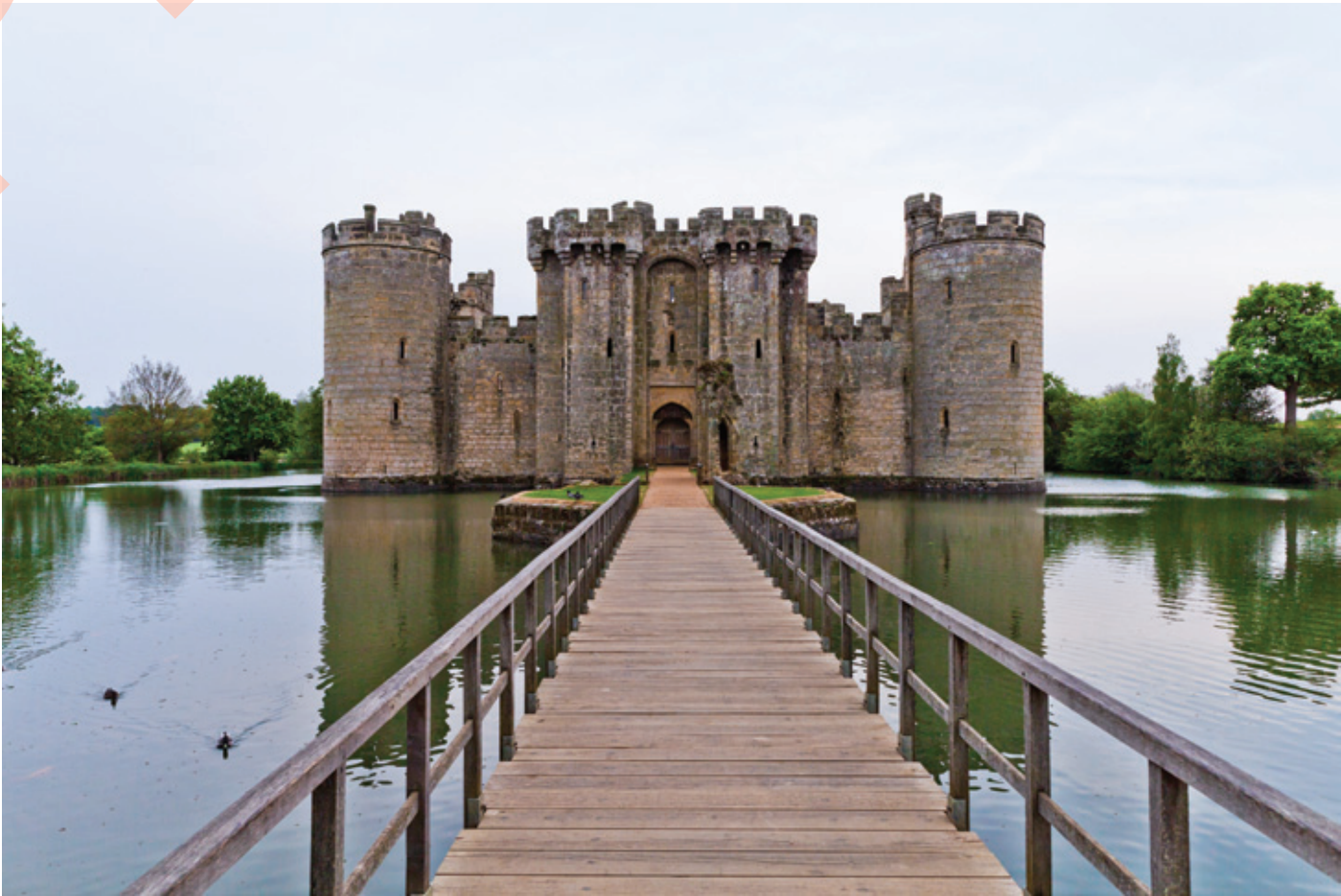
Source 1 Bodiam Castle in East Sussex, England

You are a medieval architect who has designed many manor houses and castles for English aristocrats, similar to the one shown below. You are excited to learn the English king has commissioned you and your work partner to design and build his new castle. You have been given the brief detailed on the next page. As you read the brief, jot down notes against each of the points that will help your planning and design. Discuss your response to each point with your partner, giving reasons for your choice.