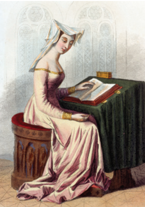
Source 1 An artist’s impression of Christine de Pizan

Despite these restrictions, some women became very influential indeed. Read about the three women below and analyse how they were able to become significant historical individuals.