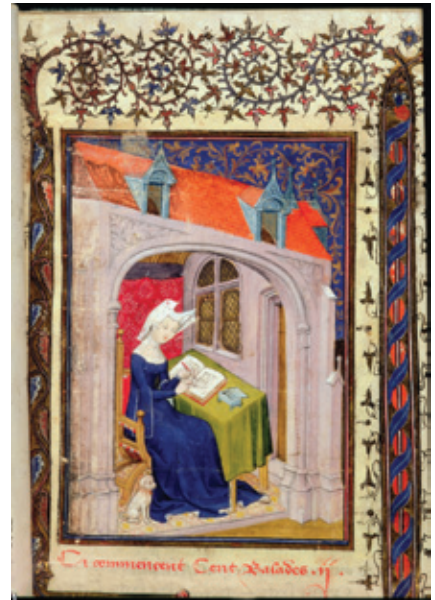
Source 4 Medieval illustration of Christine de Pizan at work