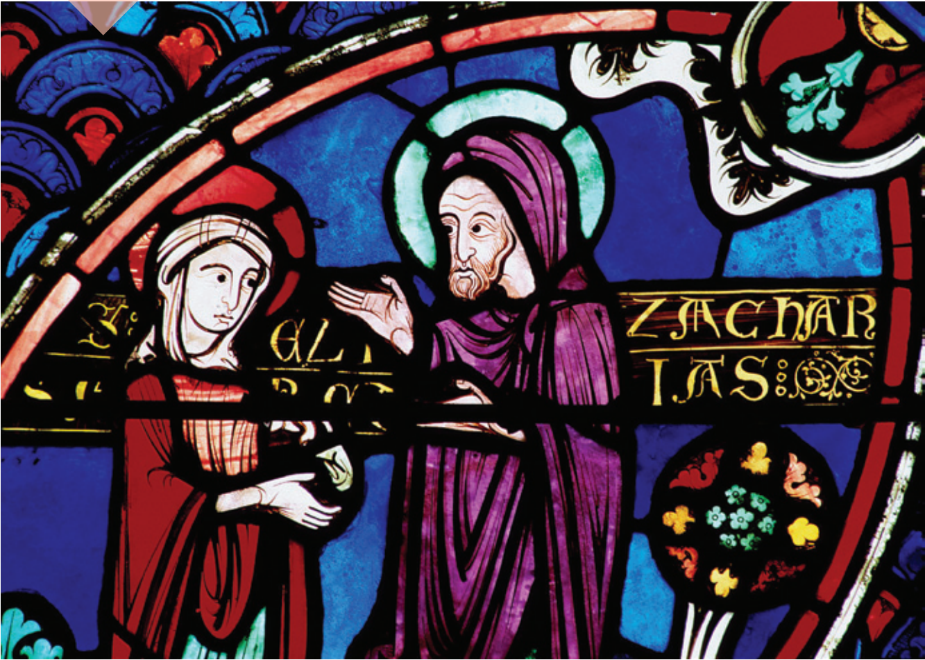
Source 1 This stained-glass window from a church in Europe is one of a series depicting the life of John the Baptist.

The Christian Church played a key role in daily life in medieval Europe and England. Almost everyone was a Christian and lived according to the teachings of the Church. Until the 15th century, however, when Gutenberg invented the printing press, monks were usually the only people who could read and write, and who had access to books. Ordinary people relied on what they were told by village priests, on what they heard and saw in religious plays, and on what they saw in the stained-glass windows of churches. Scenes, such as the one below, helped to form and reinforce their beliefs. These windows played a part in educating and ordering society.