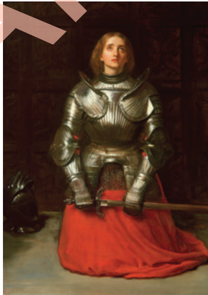
Source 3 A portrait of Joan of Arc