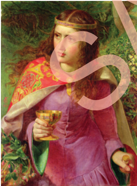
Source 2 A portrait of Eleanor of Aquitaine