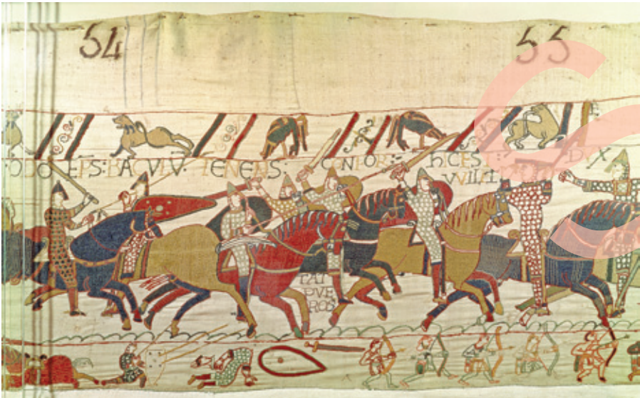
Source 2 A section of the Bayeaux Tapestry showing soldiers on horseback