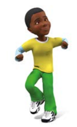
danger dangers If there is danger, something bad might happen.

When you dance, you move about in time to music.