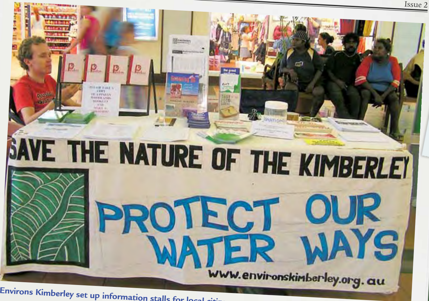
Environs Kimberley set up information stalls for local citizens.