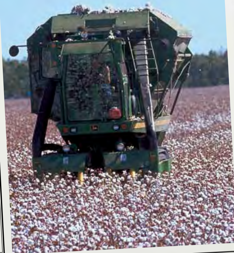
Large cotton farms can cause concern to citizens.