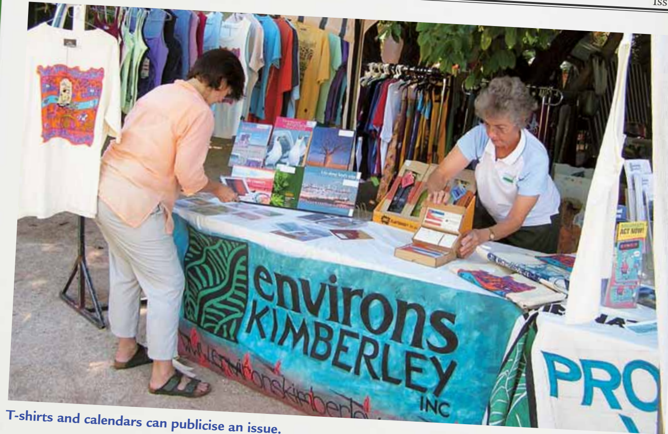
T-shirts and calendars can publicise an issue.