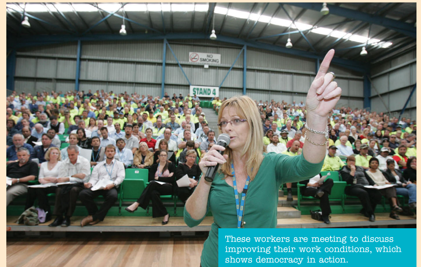
These workers are meeting to discuss improving their work conditions, which shows democracy in action.