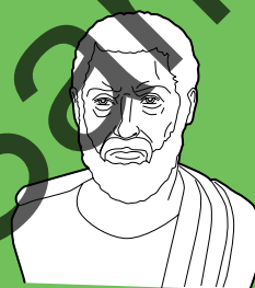
The city-states of Ancient Greece

Solon (639–559 BCE ) was an Athenian leader who made important changes that eventually led to democracy. Before his time, only the traditional ruling classes could hold positions of power, but he allowed ordinary citizens to become public officials (although they had to be quite wealthy). He set up a governing council of 400 as well as a popular court where ordinary people could appeal against the council's decisions if they were unhappy.