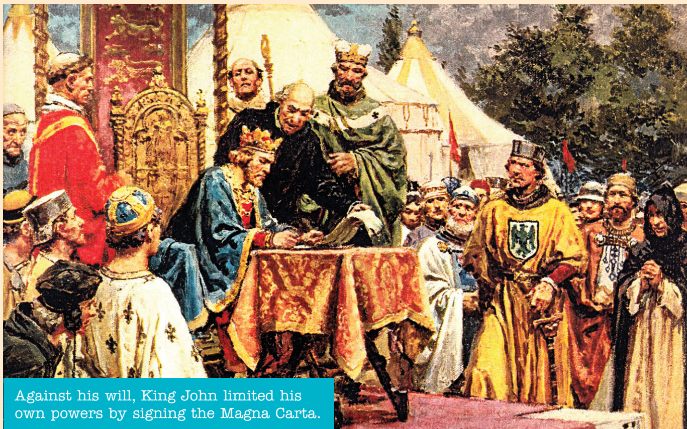
Against his will, King John limited his own powers by signing the Magna Carta.

In feudal society, those in positions of power gave some protection to those below them, in return for money and military support.