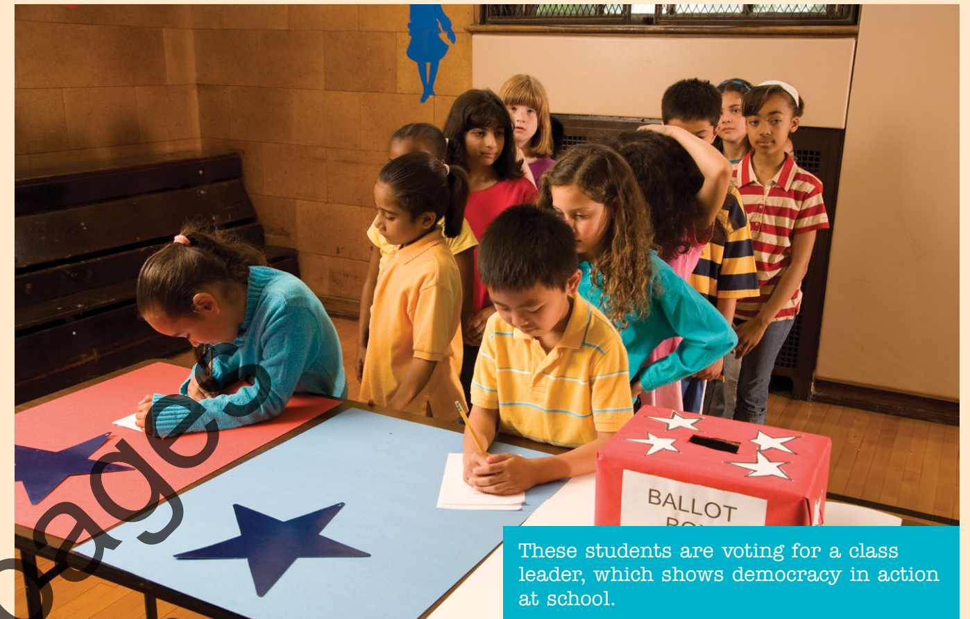
These students are voting for a class leader, which shows democracy in action at school.

This book explores how people came to believe in democracy, how democracy has been shaped over time by social and economic forces, and how we arrived at the kind of democracy we have today. It also looks at what history can teach us about keeping democracy safe and serving us into the future.